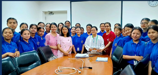
EDUCATIONAL TOUR - MANIPAL HOSPITAL, KOLKATA