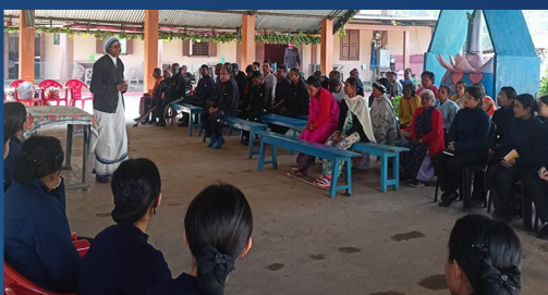
FIELD VISITS - LEPROCY CENTER, NONGPOH & RRTC, UMRAN, MEGHALAYA