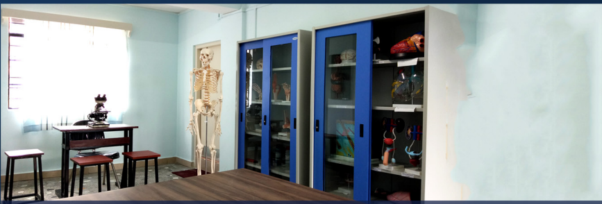
PRE-CLINICAL SCIENCE LAB